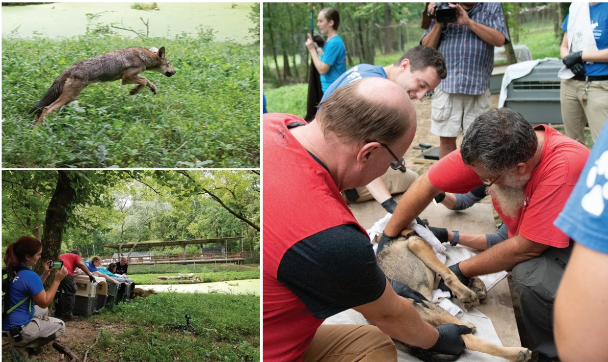
10 JONESBORO OCCASIONS SEPTEMBER 2019

“When we have the center built, we are looking at some