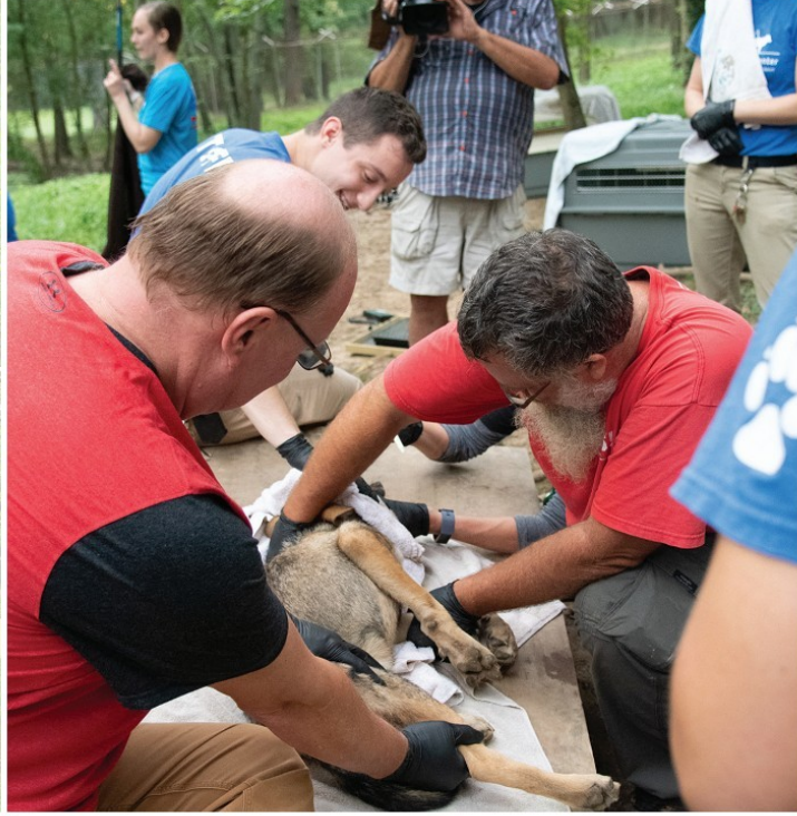
10 JONESBORO OCCASIONS SEPTEMBER 2019