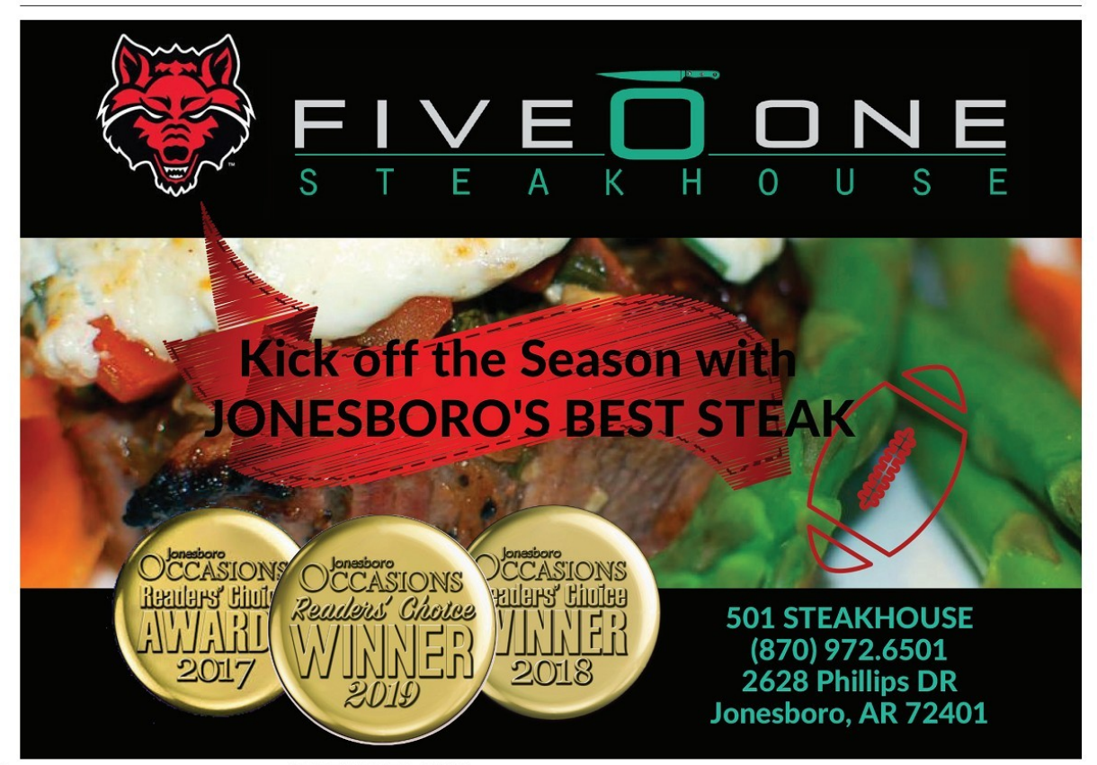
46 JONESBORO OCCASIONS SEPTEMBER 2019